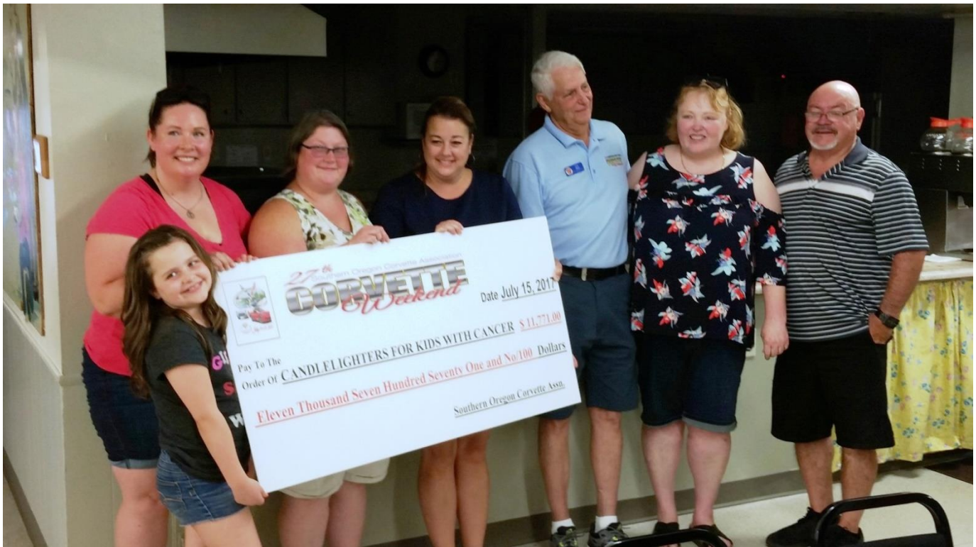
2017 Corvette Weekend Check Presentation to Candlelighters